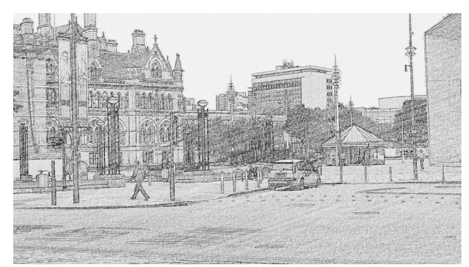
City Hall Centenary Square City Park from Plaque 6

In the Square stands the Bradford City fire disaster memorial which the Queen honoured with a wreath on her visit for the centennial ceremonies in 1997.